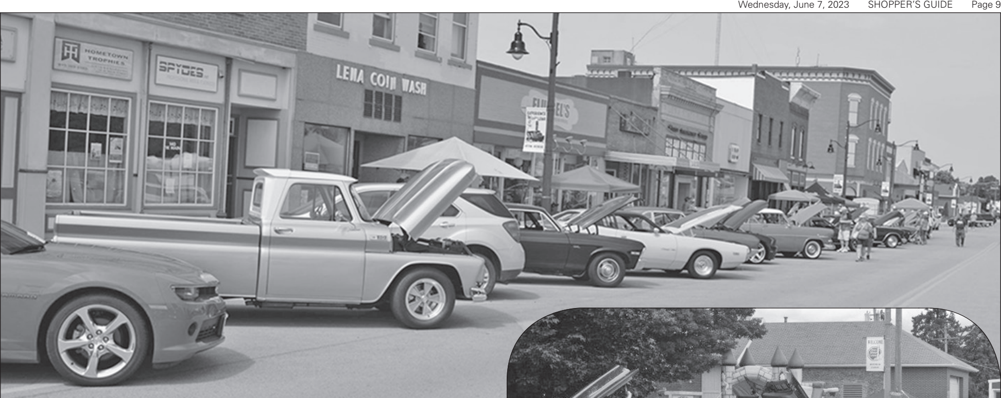
Taste of Lena