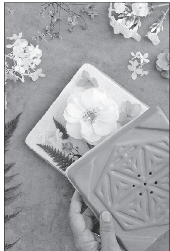
Rock Valley Publishing