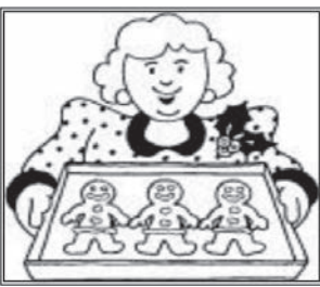
The not so skinny cook

We have had some nice June weather this past week. It is so nice to see the sun, even though I know we do need some rain. June is marching on. It is hard to believe we are half way through the first month of summer. This week's recipes continue the summer theme with some appetizers and condiments, a salad for a picnic, a salad for a lunch, a main dish and a dessert. Have a good week cooking!