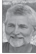
By SCOTT CERNEK Columnist

This summer is shaping up to be a lot like the summer of 1988 only without the super intense heat that we had in that summer back then. I'm sure many of us remember that year well. I remember getting a shower on Mother's Day in early May in '88 and then there was no rain until the day of our firstborn son's birth on July 22. The big difference between this year and that year was that in 1988 there was something like twelve consecutive days of triple digit heat in July. The ground dried up like powder and there was next to nothing in the fields at harvest. If a farmer got thirty bushels to the acre corn he was doing well. That was thirty-five years ago, and it still seems like yesterday.