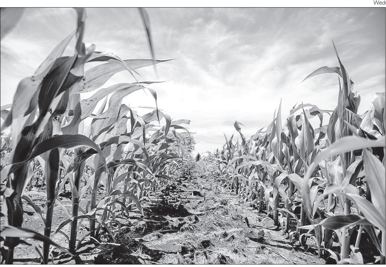
The USDA projects this year's corn crop, which U.S. farmers are still planting, could produce a record 15.3 billion bushels (up 10 percent from last year).