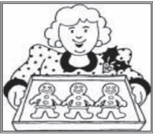
The not so skinny cook