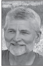
By SCOTT CERNEK Columnist

There isn't a better time of day than the mornings, if you ask me. My mornings start by making the rounds to serve up an early breakfast for all my animals around the farm. I'm quite sure that all farm animals are early risers, and they are always enthusiastic for breakfast, but the chickens are the earliest risers of all. My rooster is the guardian of my twenty or so hens and he starts crowing about four o'clock each day. I can hear him from our bedroom window the mornings that I am awake. When I go outside at about six, the entire flock is up and ready to eat. I have four small feeders set up in the chicken yard and I fill each of them with a mixture of layer feed, shelled corn and a small scoop of oyster crumbles to keep their eggshells hard. They dive right into the feed and while they are eating, I clean and refill their water containers. Then I head down to the shed to load up hay in a small wagon that I pull behind my ATV for my sheep, ponies and beef cows and calves. I have three different pastures that these animals stay on and now that we are at the end of the growing season these pastures have slowed down their production significantly. So, I have started to feed a little a little hay to supplement their diet.