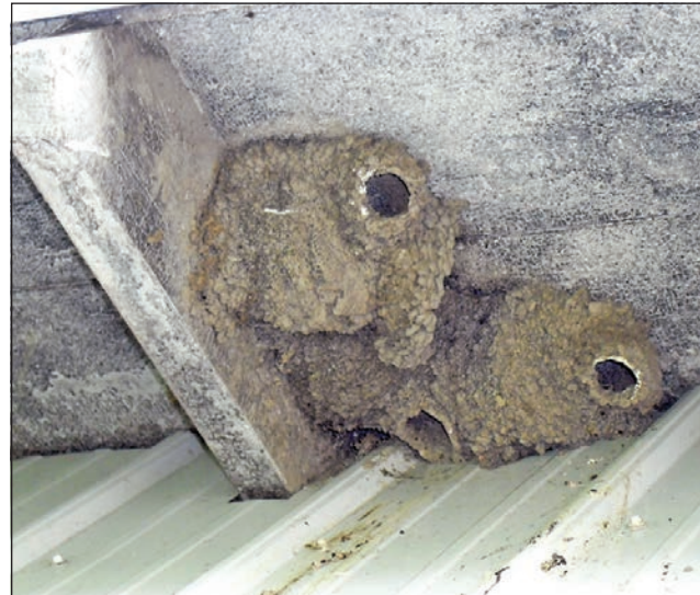
Top: Young barn swallows nest in the barn. Above: Cliff swallows nest under the barn's eave.