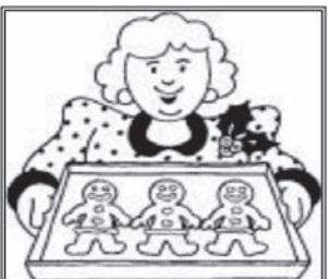
The not so skinny cook

around bread bowls. Bake, uncovered at 350 until the dip is heated through, 45 to 50 minutes. Garnish with green onions if desired. Serve with assorted fresh vegetables, crackers, and toasted bread cubes.