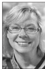
By JILL PERTLER Columnist

But what is time, really? Better put, perhaps time isn't