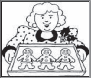
The not so skinny cook

Labor Day has ended the summer unofficially. Remember the old saying of not being able to wear white after Labor Day? I know that dates me. There are probably other things we aren't supposed to be doing, but the weather is heating up once again, so fall seems as if it is very far away. This week we have some good salads, a great sandwich, and yummy desserts. Have a good week cooking.