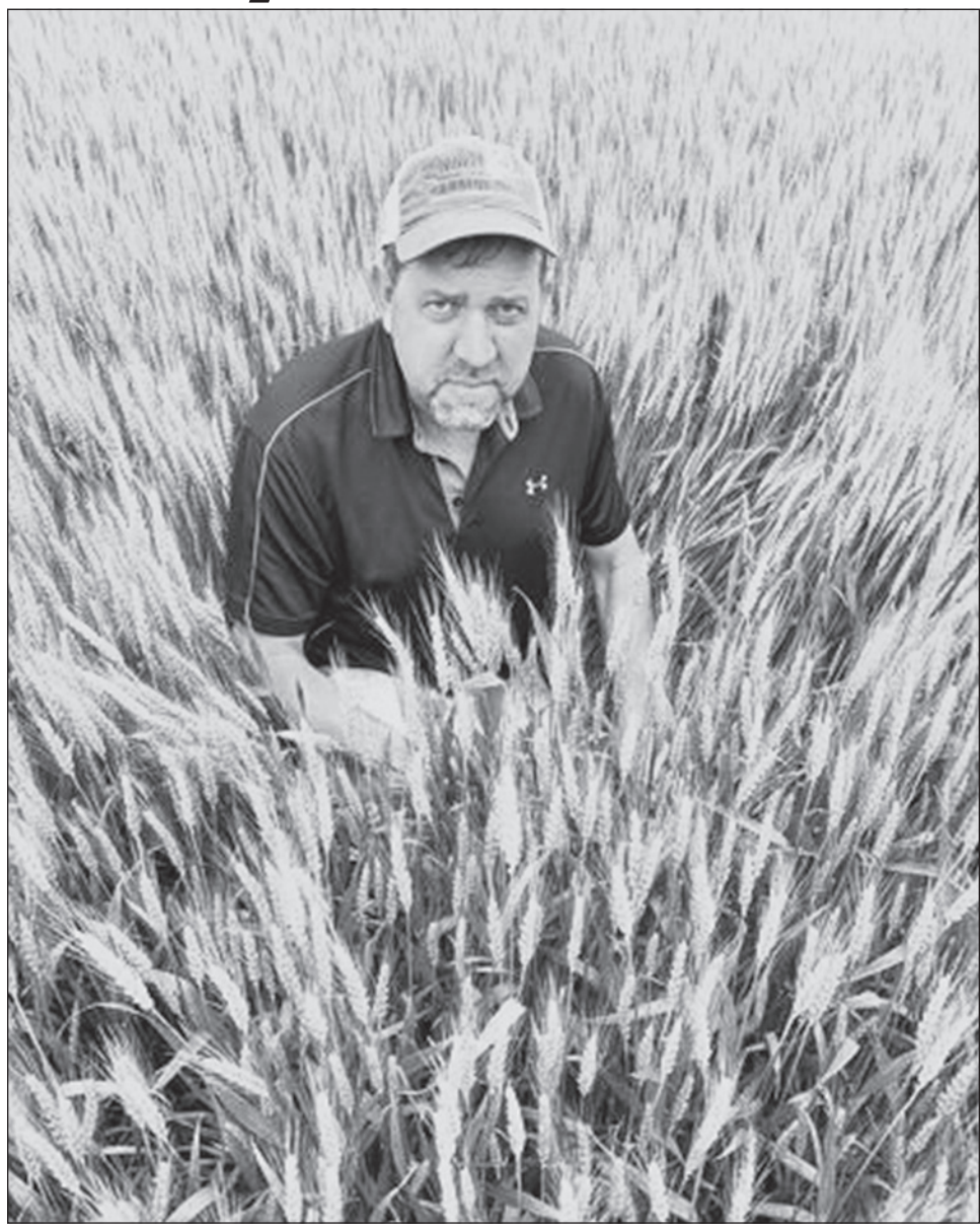
Illinois wheat growers broke yield records for the third year in a row in 2023.

This story was distributed through a cooperative project between Illinois Farm Bureau and the Illinois Press Association. For more food and farming news, visit FarmWeekNow.com.