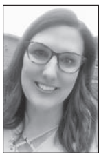
By ANNETTE EGGERS Jo Daviess County Farm Bureau

We are always looking for ways to communicate with