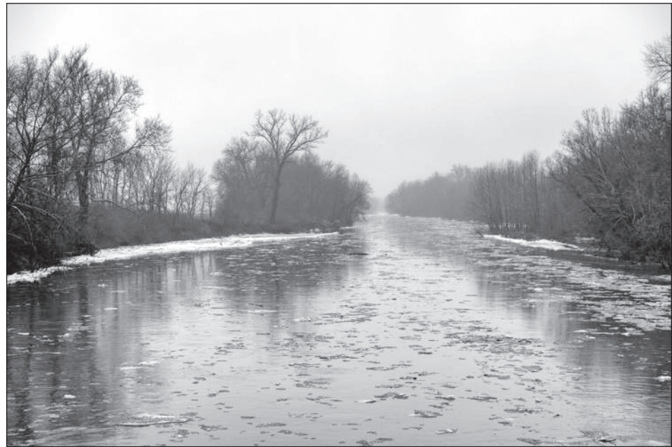
Many bodies of water, including Salt Creek along the Mason and Menard county line, rose near or beyond flood stage in parts of the state last week due to heavy precipitation and snowmelt. Ice jams on streams and rivers also contributed to flooding issues in some areas.