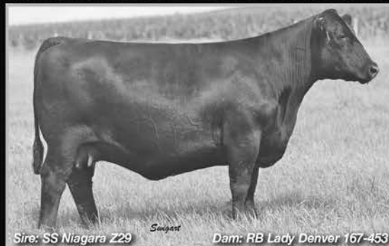
Sire: SS Niagara Z29 Dam: RB Lady Denver 167-453

OFFERING 50% INTEREST OF STONE CREEK LADY 453-1101