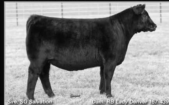
Sire: SG Salvation Dam: RB Lady Denver 167-439