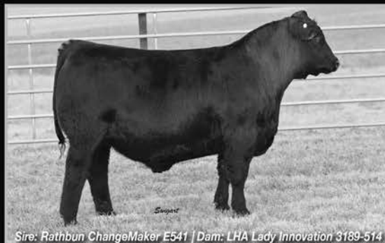
Sire: Rathbun ChangeMaker E541 | Dam: LHA Lady Innovation 3189-514

STONE CREEK CHANGEMAKER 2246 AAA 20582497