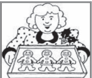
The not so skinny cook

It is hard to believe that February is half over, Lent has started, and St. Patrick's Day is less than a month away. There will be some meatless recipes for Lent for the next couple of weeks. Red recipes will be featured again this week. Enjoy cooking some interesting recipes this week!