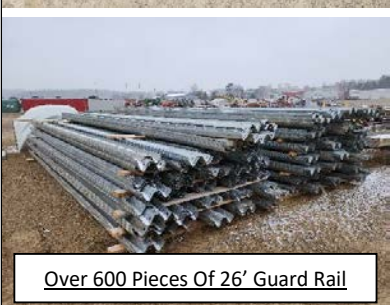
Over 600 Pieces Of 26' Guard Rail

Online Bidding Available Through Equipmentfacts.com Terms and Conditions: A Photo ID Is Required to Register. All Items Must Be Paid for The Day of Sale By: Cash, Check, ACH or Credit Card with A 4% Convenience Fee. Wisconsin Sales Tax Of 5.5% Applies to Certain Items. April 19 th : 2.5% Buyers Premium Day of Auction for Online Buyers Capped at $750 Per Item Purchased, April 20 th Buyers Premium 10% Live Onsite & 12% Buyers Premium Online. All Internet Buyers Must Pay Within 3 Days of Auction. All Sales Are Final – Everything Sold AS IS – WHERE IS with No Warranties or Guarantees Expressed or Implied. A $50 Doc Fee Applies on ALL Titled Registered Items. All Titles Will Be Sent 15 Business Days After The Auction. Powers Auction Service Is Not Responsible for Items Once Sold. Announcements Made Day of Sale Supersede Any Printed Materials. The Buyer Is Held Responsible to Inspect Merchandise Before Purchasing. All Items Must Be Removed Within 2 Weeks After The Auction All Items Left Will Be Consigned For Our Next Auction In July