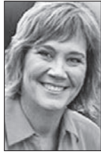
By MELINDA MYERS Columnist

It's never too early to prepare for the garden season ahead. Having the right tool for the job saves time, reduces the frustration of trying to make the wrong tool work, and allows you to garden longer with less muscle fatigue.