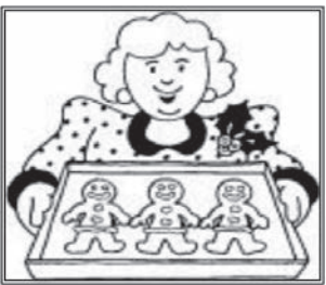
The not so skinny cook

Boy did we get hit with winter once again. As I am getting ready to send this column the snow is falling, and the wind is blowing. I am hoping it quits soon. My recipes are for spring, so maybe by the time the column comes out, it will be spring weather again. Have a great week cooking.