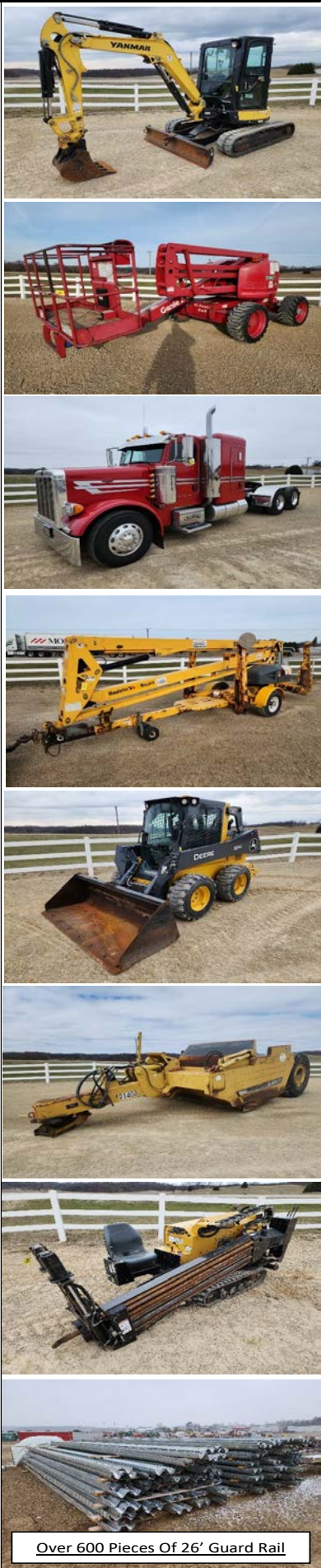
Over 600 Pieces Of 26' Guard Rail

Online Bidding Available Through Equipmentfacts.com Terms and Conditions: A Photo ID Is Required to Register. All Items Must Be Paid for The Day of Sale By: Cash, Check, ACH or Credit Card with a 4% Convenience Fee. Wisconsin Sales Tax Of 5.5% Applies to Certain Items. April 19 th 2.5% Buyers Premium Day of Auction for Online Buyers Capped at $750 Per Item Purchased, April 20 th Buyers Premium 10% Live Onsite & 12% Buyers Premium Online. All Internet Buyers Must Pay Within 3 Days of Auction. All Sales Are Final – Everything Sold AS IS – WHERE IS with No Warranties or Guarantees Expressed or Implied. A $50 Doc Fee Applies on ALL Titled Registered Items. All Titles Will Be Sent 15 Business Days After The Auction. Powers Auction Service Is Not Responsible for Items Once Sold. Announcements Made Day of Sale Supersede Any Printed Materials. The Buyer Is Held Responsible to Inspect Merchandise Before Purchasing. All Items Must Be Removed Within 2 Weeks After The Auction All Items Left Will Be Consigned For Our Next Auction In July