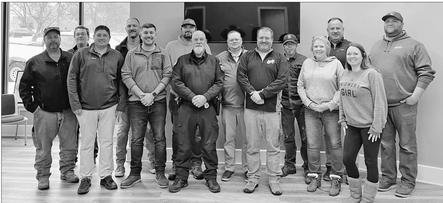
VILLAGE OF ELIZABETH, IL FACEBOOK PHOTO Rock Valley Publishing