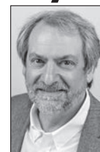
By DR. STEPHEN PETRAS Illinois Licensed General Dentist

Calcium helps keep teeth and bones strong and healthy. When calcium levels drop, the teeth become weaker and more vulnerable to the bacteria and acids that cause decay. Calcium also assists in muscle movement and in the release of hormones and enzymes. Phosphorus and calcium work together in bone production and to form hydroxyapatite, the main component of enamel. Your body cannot fully absorb and utilize calcium without phosphorus, and a deficiency in phosphorus can lead to brittle teeth. Like milk, cheese is high in phosphorus and calcium. Potassium is a mineral that works to strengthen your bones and teeth. Potassium helps to regulate blood acidity. When your blood becomes too acidic, the acids can remove calcium from your teeth and jawbone, weakening them. The protein in milk not only helps in calcium absorption and bone growth, but casein proteins