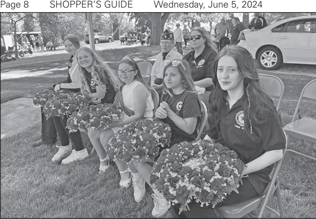
SUBMITTED PHOTO Rock Valley Publishing