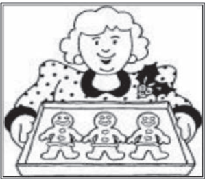
The not so skinny cook

We have been dodging rain for the last week as well as trying to stay cool. We are behind in 90-degree days for July, but maybe after this past week we will catch up. This week's recipes are full of some favorites with a different spin and some new ones. Have a great week cooking!