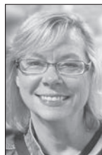
By JILL PERTLER Columnist

20s: You desire someone with a good heart