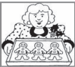
The not so skinny cook