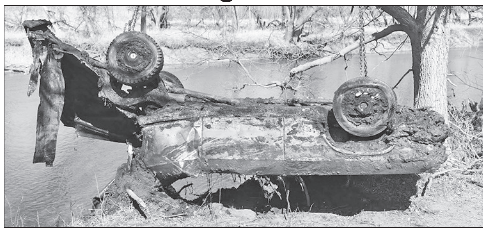
This 1966 Impala with skeletal remains inside was hoisted from the Pecatonica River by a crane on March 11. In a press release sent by the Winnebago County Coroner's Office recently, it was revealed the skeletal remains were that of two missing men from 1976.