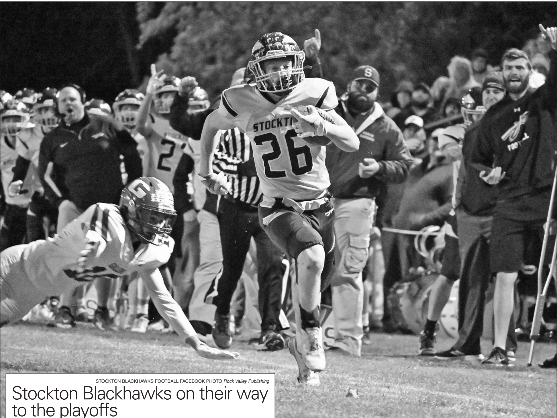
STOCKTON BLACKHAWKS FOOTBALL FACEBOOK PHOTO Rock Valley Publishing