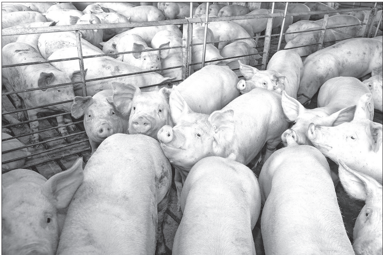
USDA’s September hogs and pigs report pegged the inventory at 76.5 million head, up 2 percent since June.

This story was distributed through a cooperative project between Illinois Farm Bureau and the Illinois Press Association. For more food and farming news, visit FarmWeekNow.com.