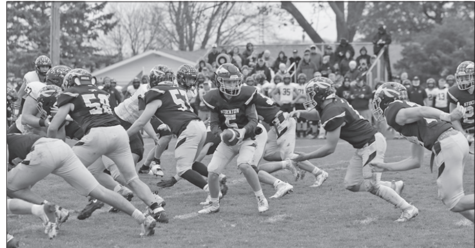
STOCKTON BLACKHAWKS