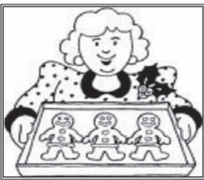
The not so skinny cook

We are still lucky to have mild weather for November. The 10-day forecast shows us still having weather in the upper 50's; the nights are cooler, but we still haven't had that killer freeze. I do remember some Thanksgiving dinners where people grilled out. I also remember Thanksgiving snowstorms, so it is why they always say that Midwest weather is never boring! This week we are featuring some holiday recipes as well as some great weekday recipes. Have a great week cooking.