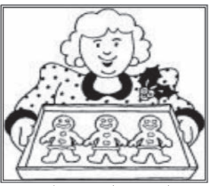
The not so skinny cook