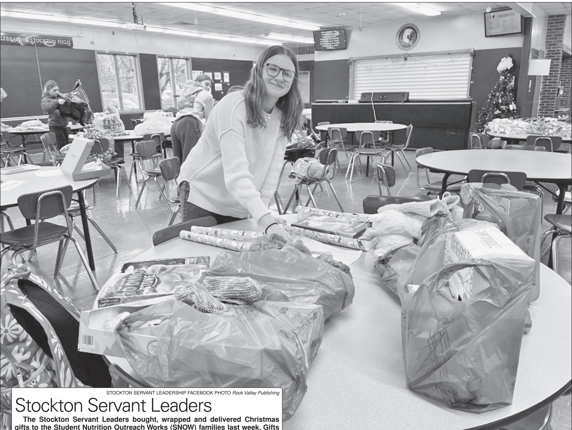
STOCKTON SERVANT LEADERSHIP FACEBOOK PHOTO Rock Valley Publishing