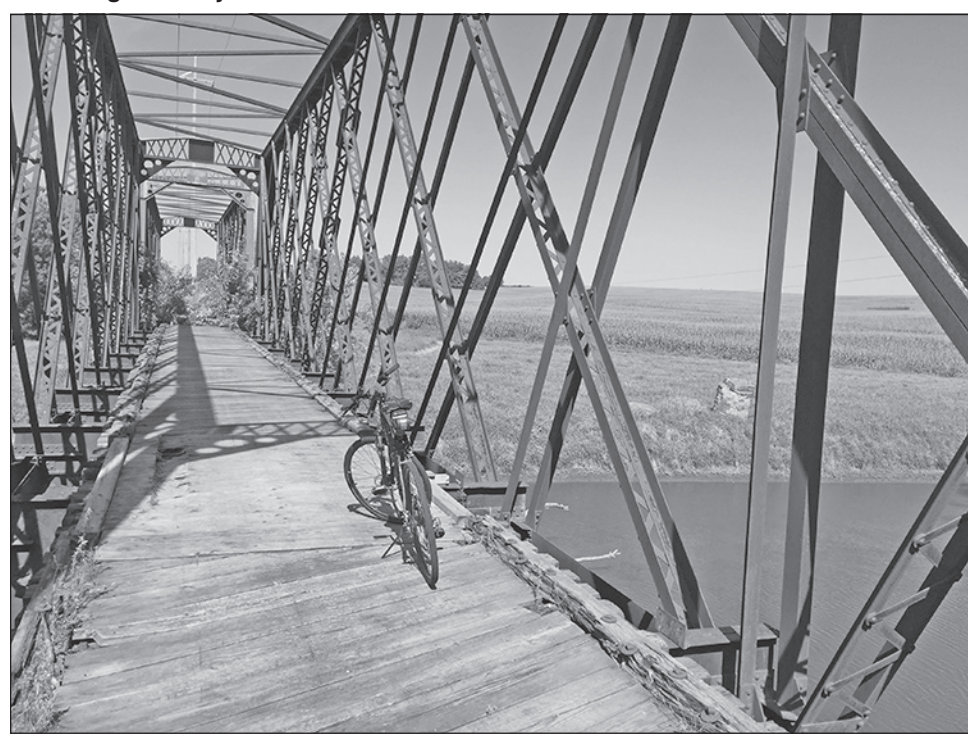
The Pecatonica Prairie Trail is a great place for bicyclists. The trail follows the C&NW right-of-way and is around 30 miles.

The trail crosses many different types of landscape and, for much of the way, is also part of the 575 mile bike trail Grand Illinois Trail, which is itself a part of the 3,700 mile coast-tocoast Great American Rail