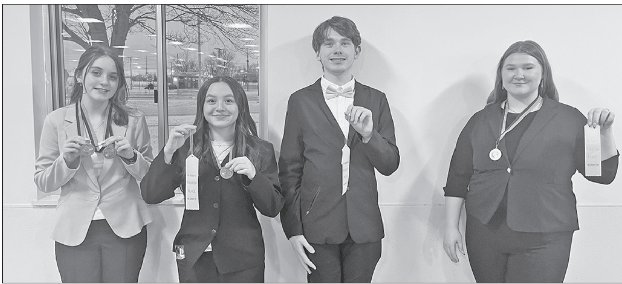
STOCKTON HIGH SCHOOL FACEBOOK PHOTO Rock Valley Publishing