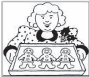
The not so skinny cook

As I write this column, they are calling for snow. It will be interesting to see if we get the dusting they are calling for. My Springfield friend had over seven inches dumped on her. I was glad we dodged that bullet. We continue to off winter recipes. Have a great week cooking.