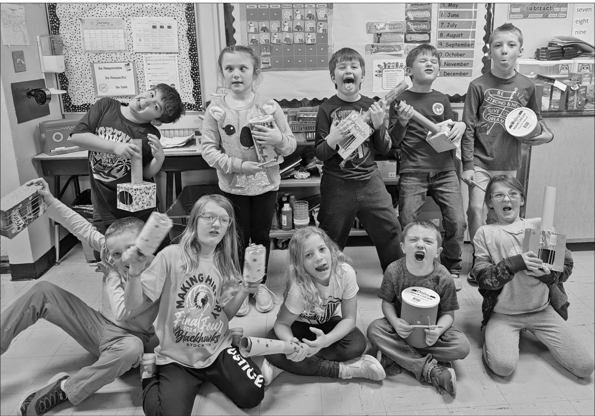
STOCKTON ELEMENTARY SCHOOL FACEBOOK PHOTO Rock Valley Publishing