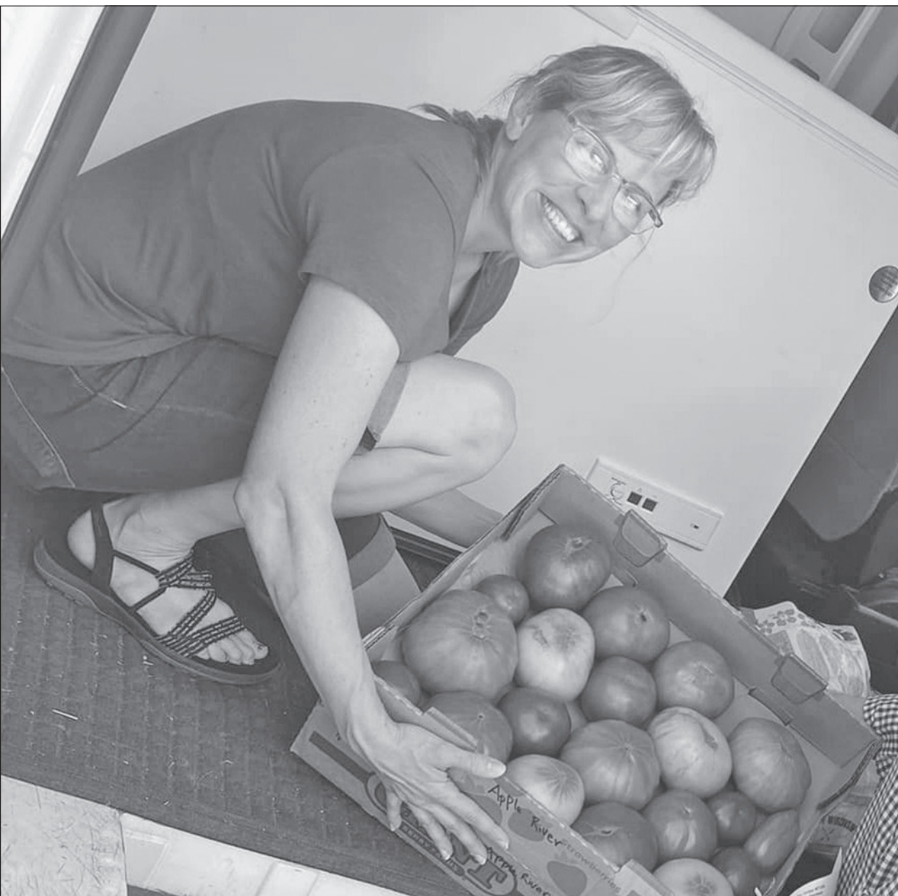
JO DAVIESS LOCAL FOODS FACEBOOK PHOTO Rock Valley Publishing