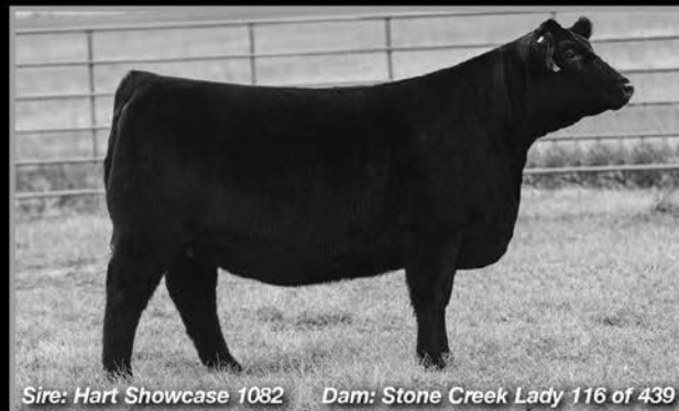
Sire: Hart Showcase 1082 Dam: Stone Creek Lady 116 of 439