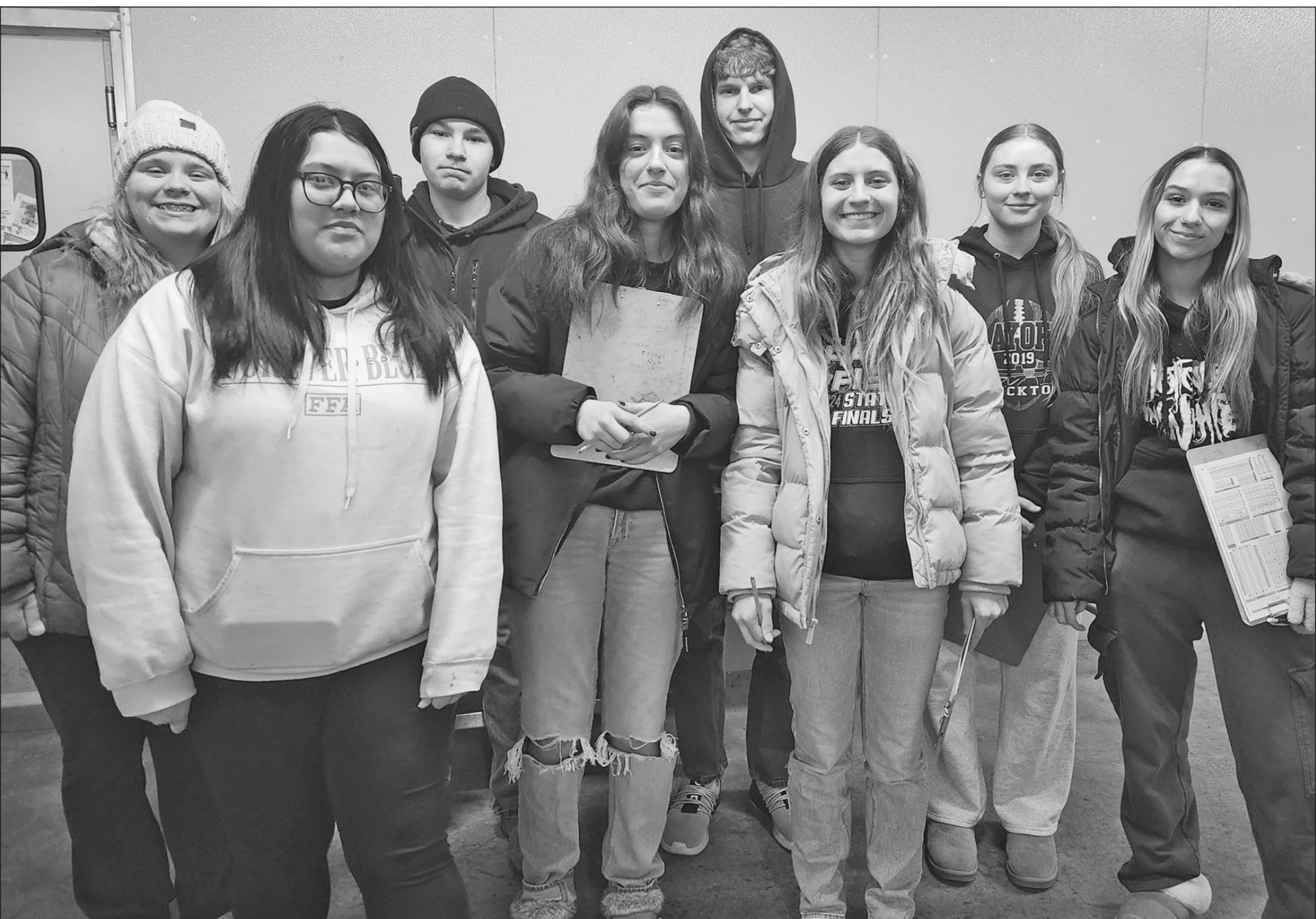
STOCKTON FFA CHAPTER FACEBOOK PHOTO Rock Valley Publishing