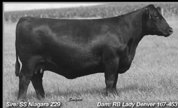
Sire: SS Niagara Z29 Swgart Dam: RB Lady Denver 167-453

OFFERING SONS & DAUGHTERS TO THE $148,000 LEAD-OFF FEMALE OF OUR 2024 SALE