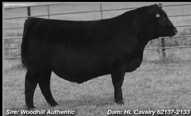
Sire: Woodhill Authentic Dam: HL Cavalry 62137-2133