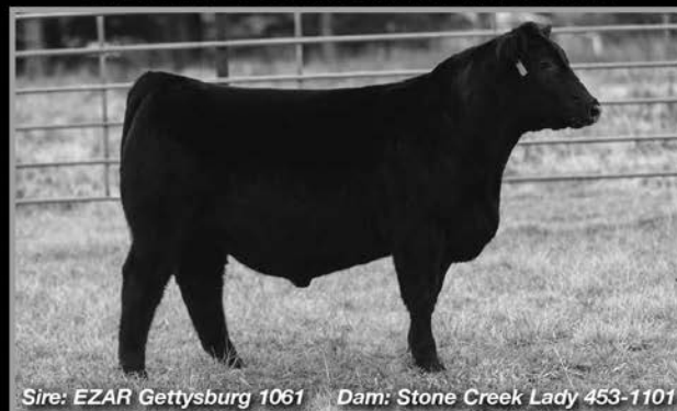
Sire: EZAR Gettysburg 1061 Dam: Stone Creek Lady 453-1101

STONE CREEK GETTYSBURG 4034 AAA 21014263