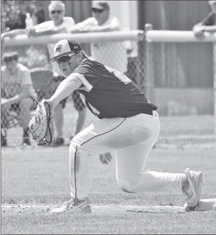
LENA-WINSLOW BASEBALL