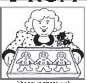
The not so skinny cook

We finally got our much needed rain. It could have rained several more days, but we were grateful for the rain we did get. The weather was unseasonably cool, but it is warming up a little bit at a time. Gardens are growing, crops are sprouting out of the fields, and summer activities have begun. We have some summer recipes as well as some interesting recipes you can use all year long. Have a