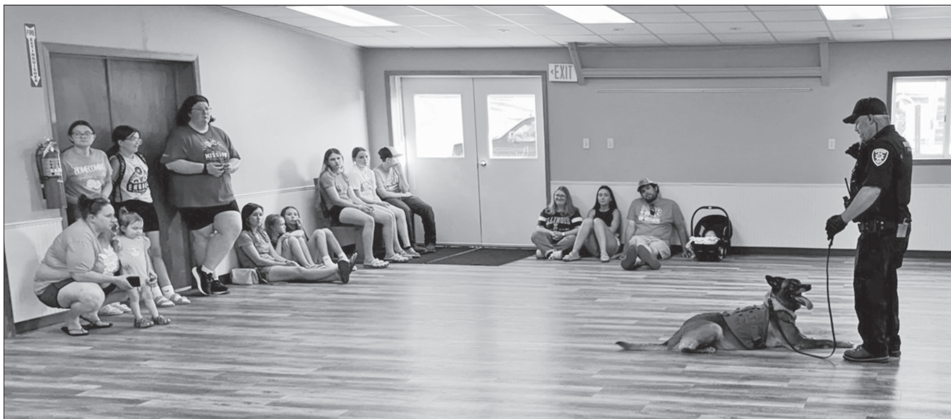
JO DAVIESS COUNTY SHERIFF'S OFFICE FACEBOOK PHOTO Rock Valley Publishing